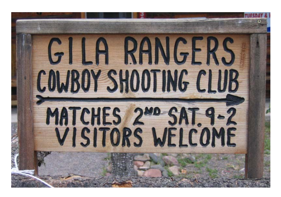
There was no indication of how many points you earned for each cowboy shot. Southern New Mexico.