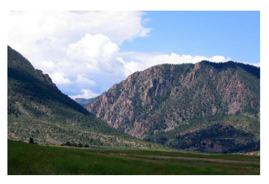
Typical Colorado view. Northern Colorado.