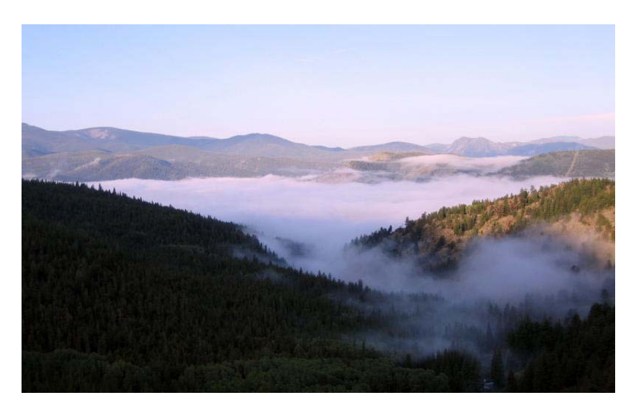
Colorado valley at sunrise. Northern Colorado.