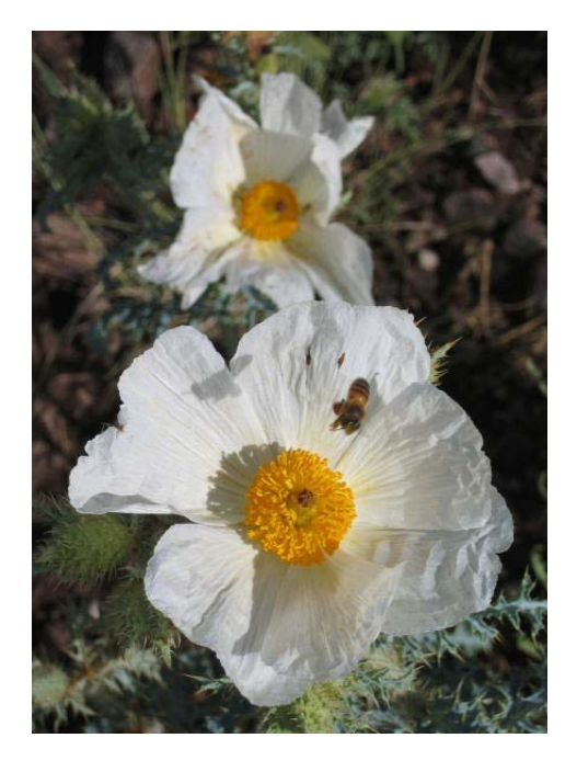
Thistle blossom with bee. Southern New Mexico.

Attention all southern California homeowners. 20+ acres from $19,800. Central New Mexico.