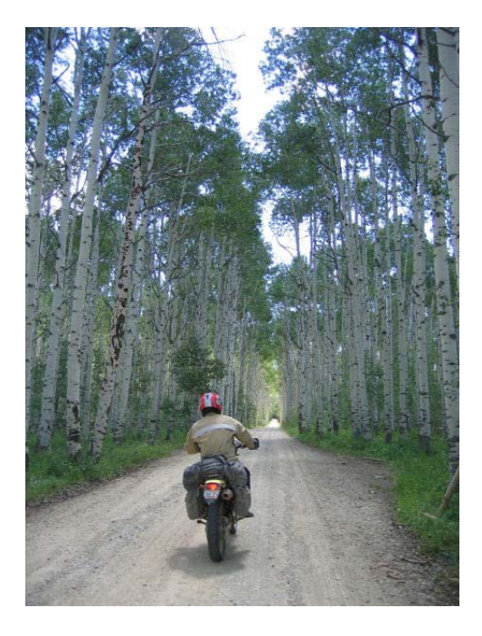
Brent Ross riding through a grove of aspens. Southern Wyoming.

The Continental Divide riders convention, 2004. We came across these two groups of bicyclists riding the route. One group was headed north, the other south. They average about 5 liters of water per day. The northbound group was headed into a section where there was no water available for at least two days at their rate of travel. Southern Wyoming.