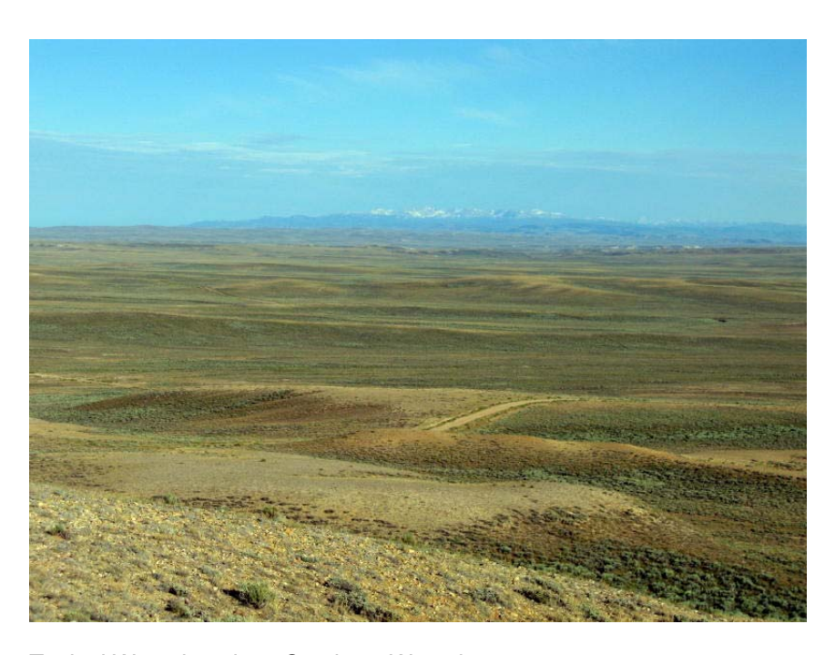
Typical Wyoming vista. Southern Wyoming.

PS – some photos of the last half of the trip follow