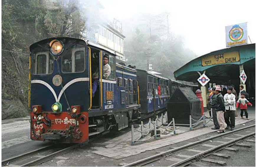
Narrow gauge railway, Ghum, India.