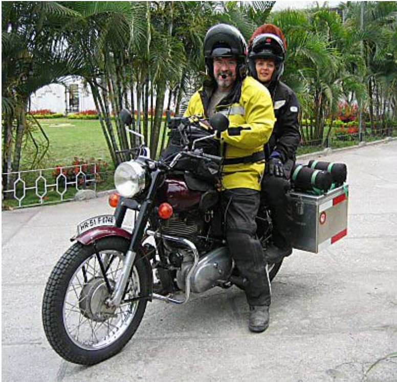
Ready to ride. Royal Enfield Bullet 500.