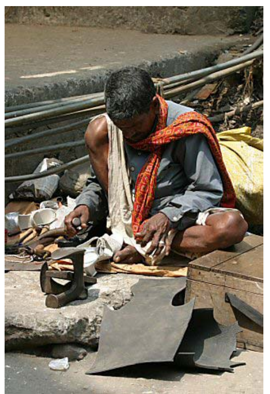
Shoe repair. Kalimpong, India.