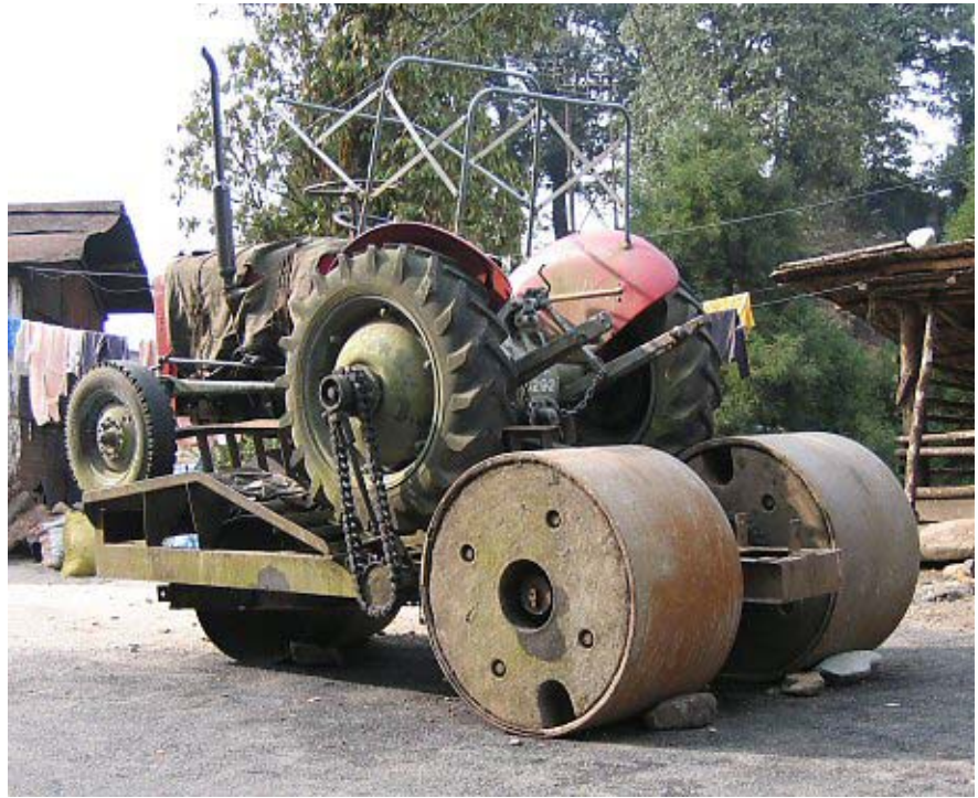
Asphalt roller. On the road to Darjeeline, India.