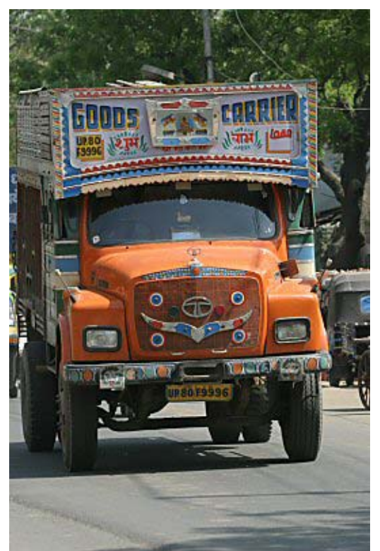
Typical truck. Agra, India