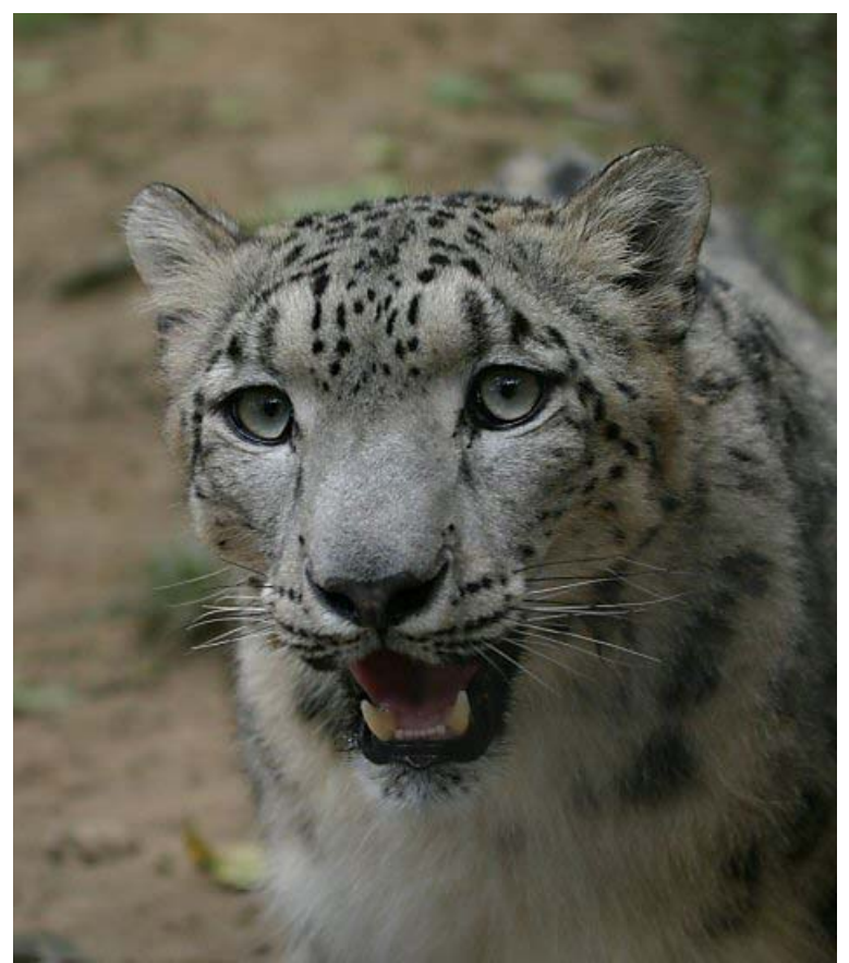
Snow Leopard. Darjeeling, India.