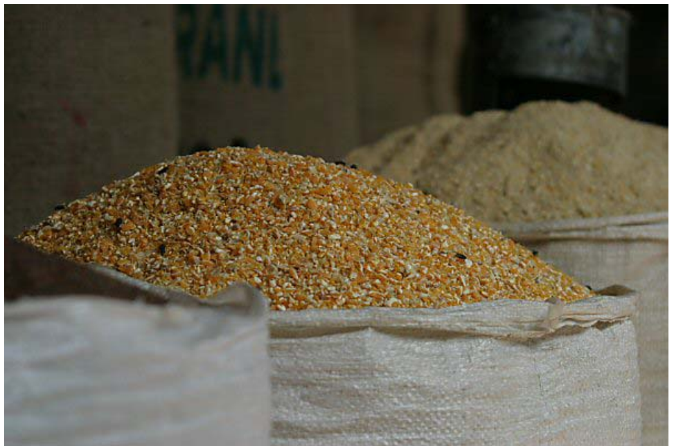
Market corn. Kalimpong, India.