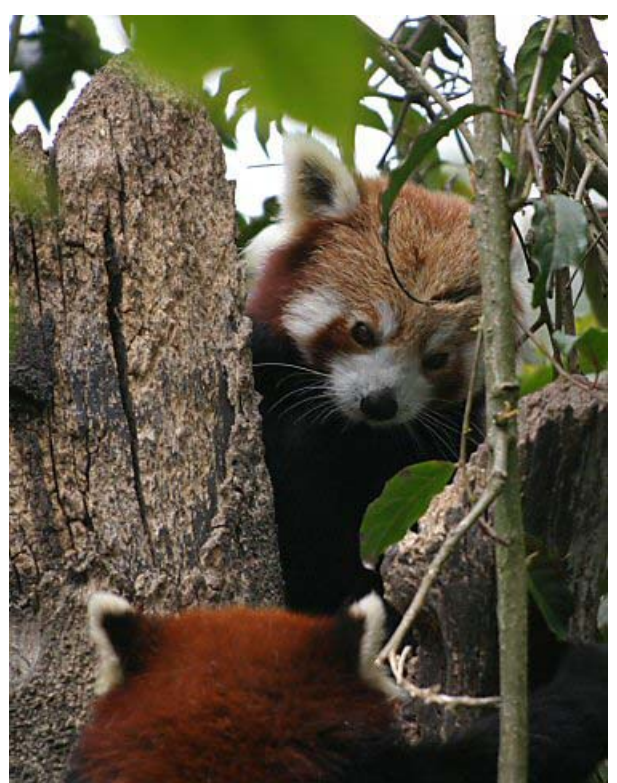
Red Panda. Darjeeline, India.