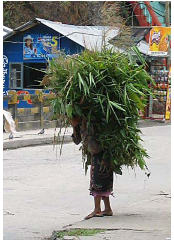
Woman carrying load. On the road to Kalimpong, India.