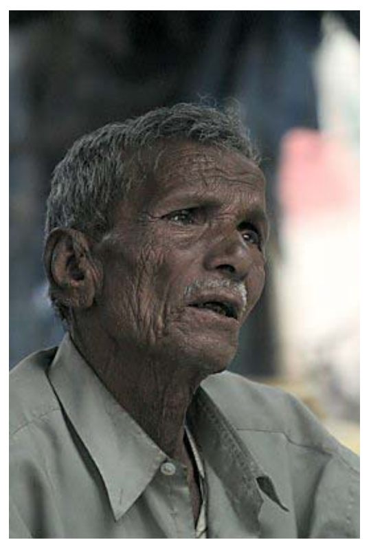
Peanut vendor. Kalimpong, India.