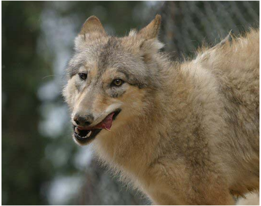
Tibetan wolf eating lunch. Darjeeline, India