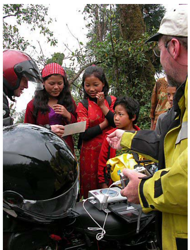
Giving pictures to a mountain family. We printed these prints from our digital camera with a small printer we are carrying on the bike. As we understand it, this is the first family photo they have ever had. On the road to Darjeeline, India.