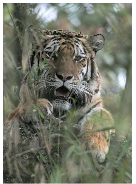
Siberian Tiger, Darjeeline, India