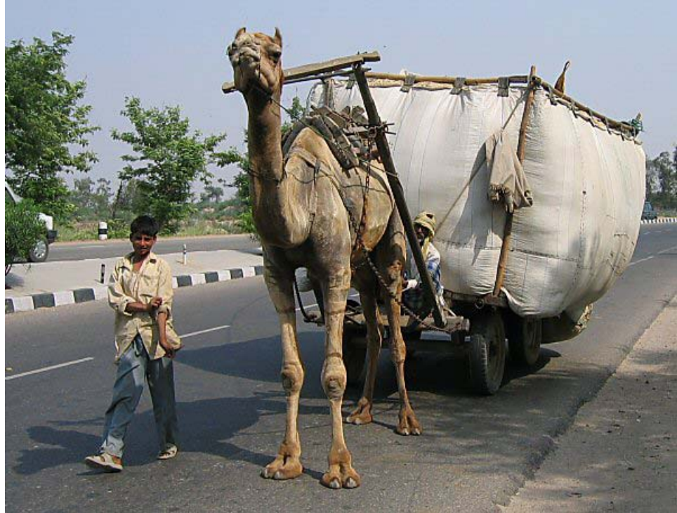
Camel pulling a wagon loaded with the wheat crop to market. South of Delhi, India.