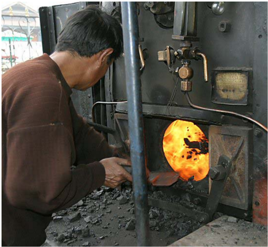
Engineer stoking the fire of his steam locomotive. Ghum, India.