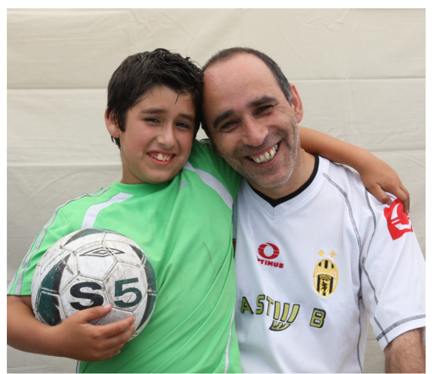
The proud fathers