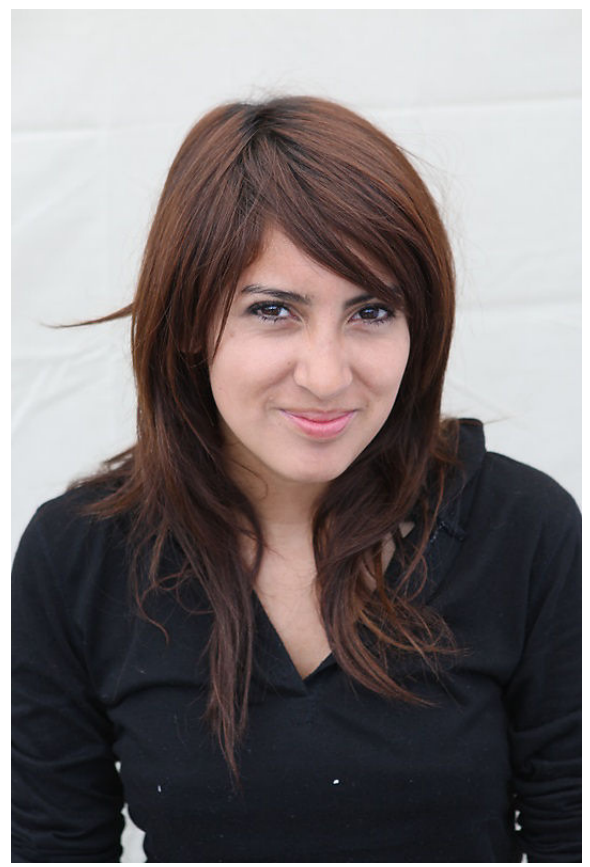
The young girls.