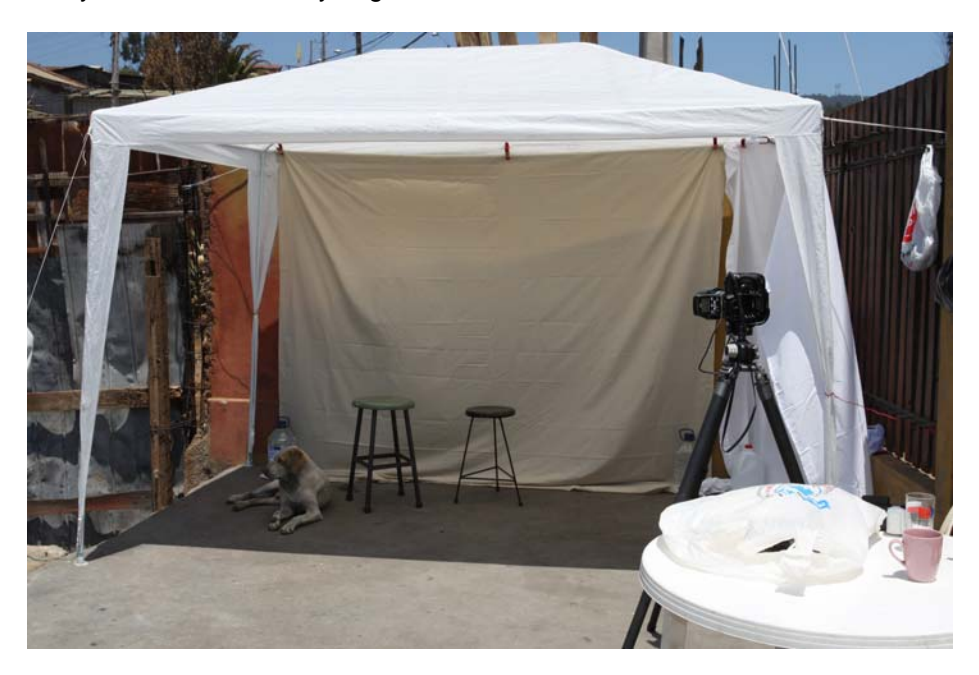
And they came.

We constructed a simple studio from a borrowed canopy and a couple of bed sheets, and invited everyone, even the family dogs.