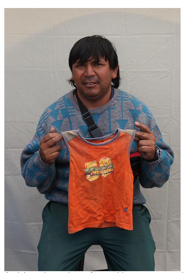
And those burned out of everything except one child's shirt.