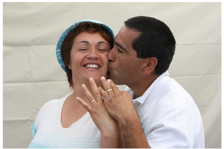
Even the newlyweds who lost their wedding pictures.