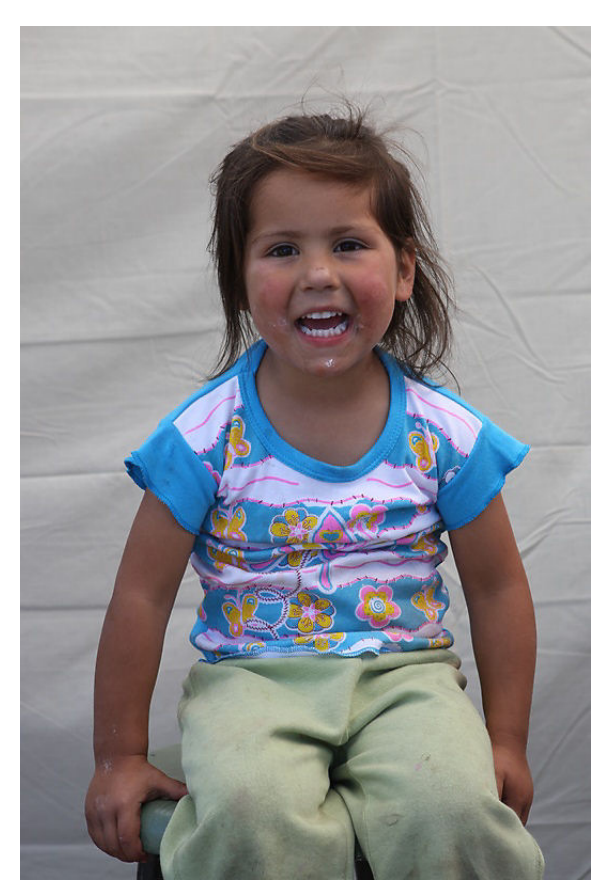
The bubbly children.