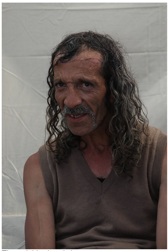
The neighborhood character.