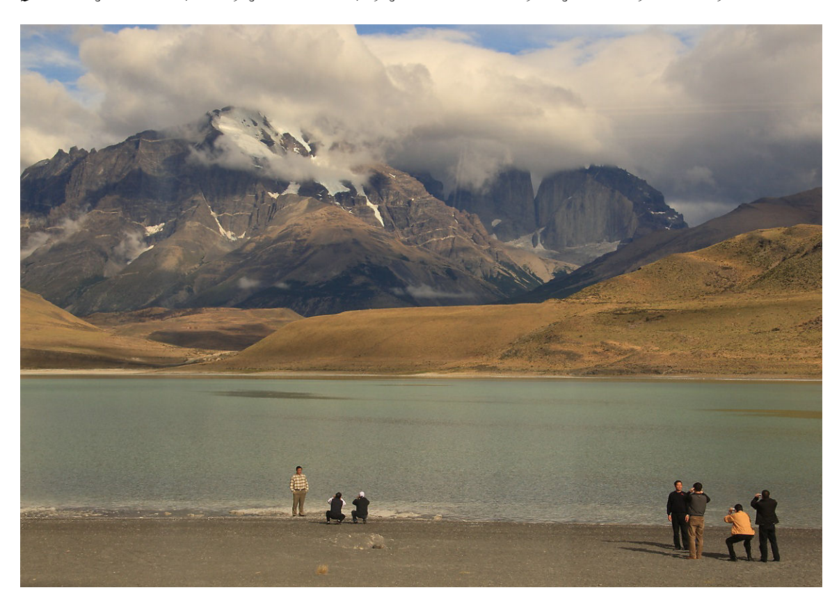
Only those who linger, waiting, watching, will be rewarded.

For many will come, but they will not see, they will not know the mysteries that lie within.