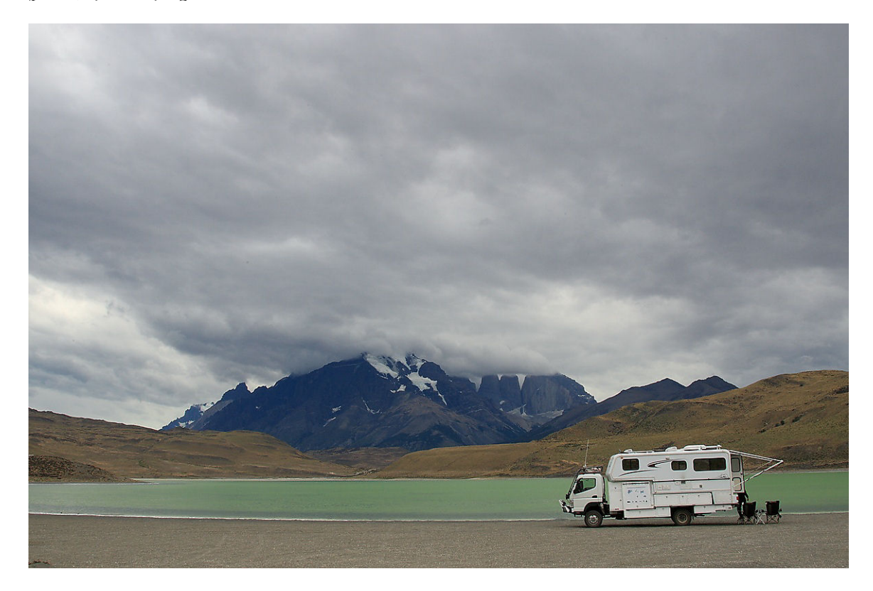
Second, the watching waters will turn to glass.

First, the watching waters will become an emerald.