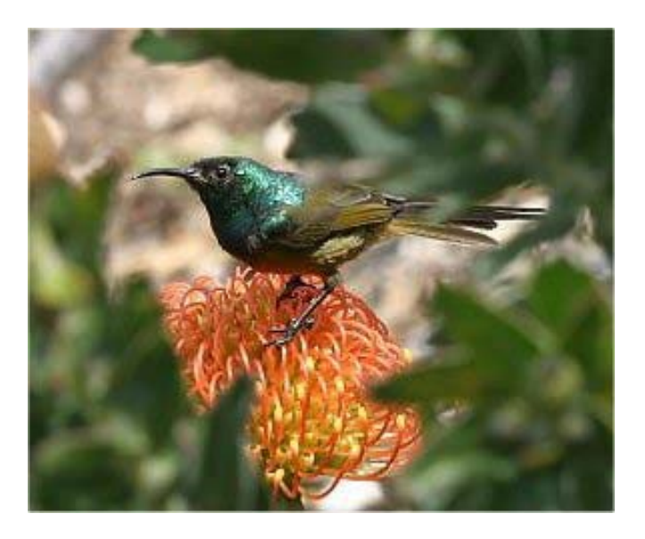
A sunbird perched on a protea, one of the dozens of protea species represented at the park.