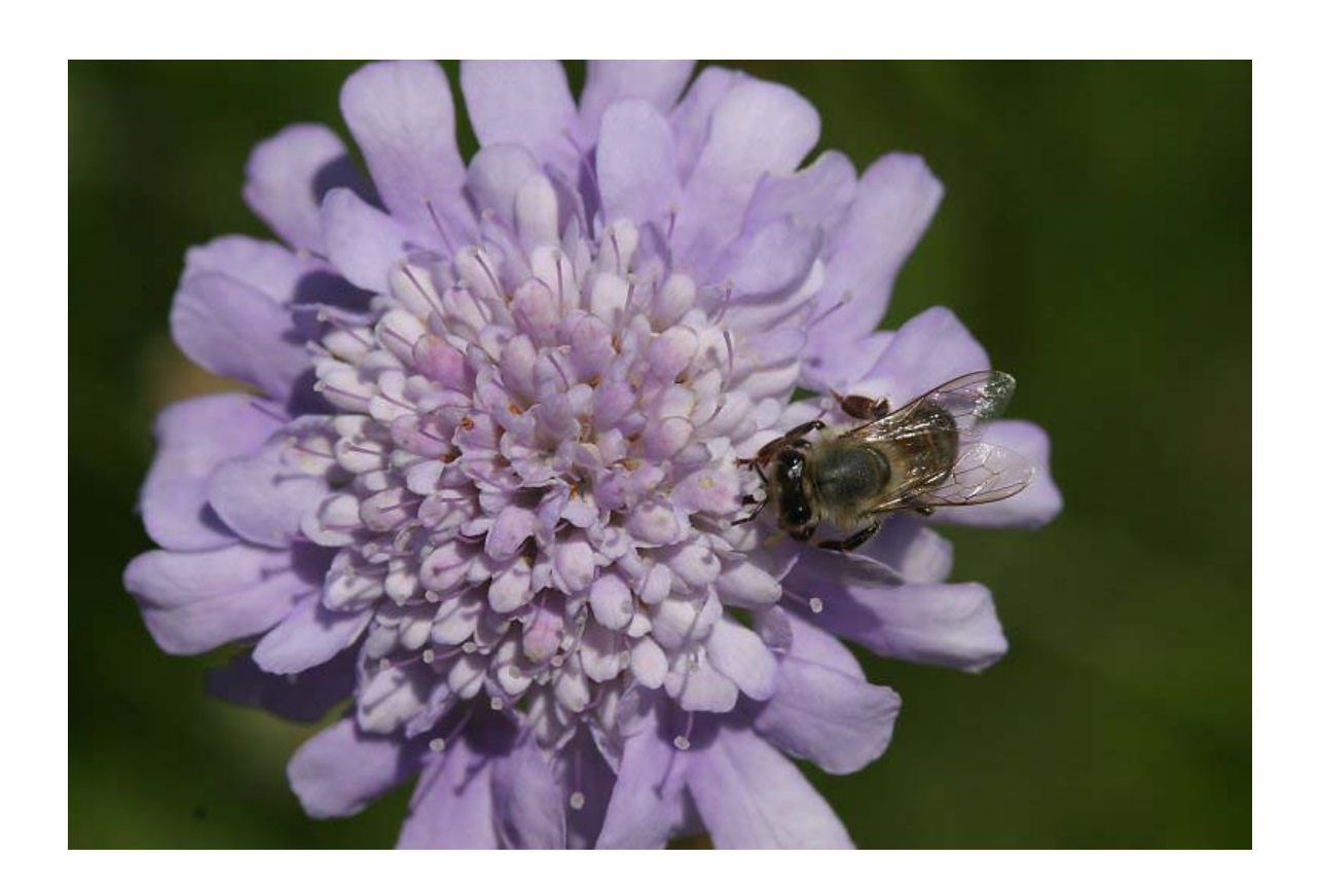
I also shot a few plants and flowers :