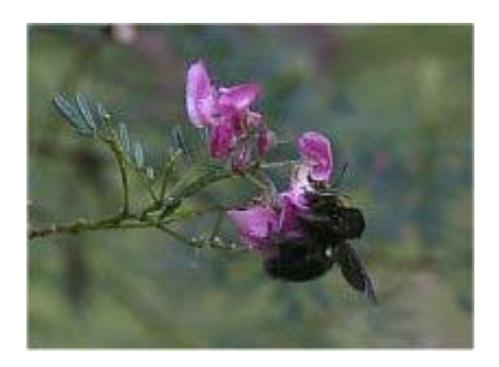
That's a tree branch. The bug is about half as big as my fist.