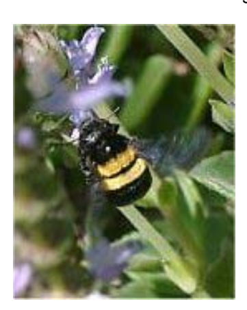
This one is a bit smaller, it's about 1.5 times as big as my thumb.