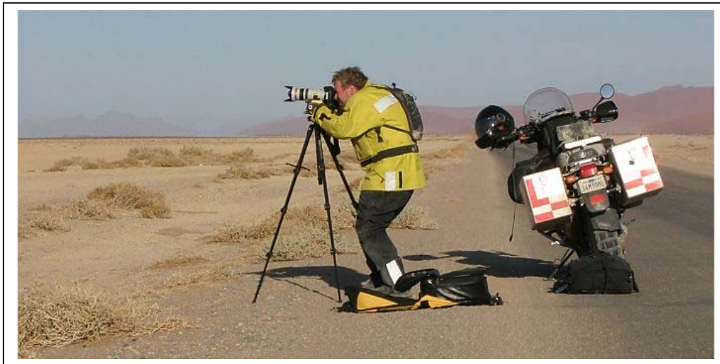
Shooting the Sossusvlei valley in the Namibian dune sea.