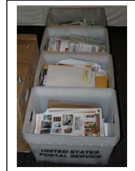
Four bins of mail awaited us.