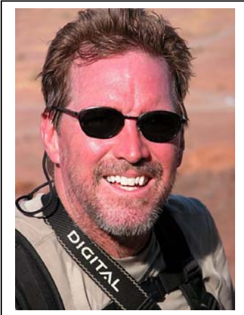
Hiking in the mountains of Namibia.

Special thanks to all of you who kept us in your thoughts and prayers and were worried about our safety in Africa and that of our home here in California.